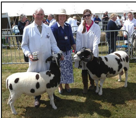
Devon County Show: From left: Champion & Reserve Breed Cham- pions: See results above right.

Jacob Sheep Society Website: www.jacobsheepsociety.org.uk